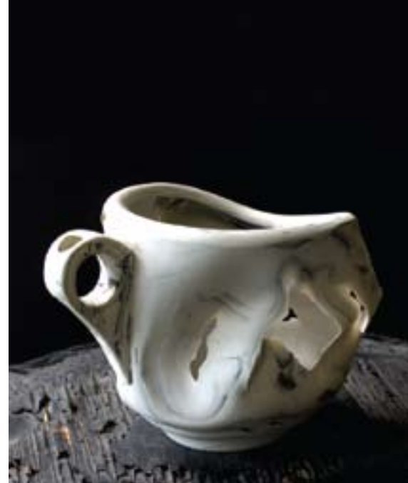
Irv Tapper '69, "Too late to be early"