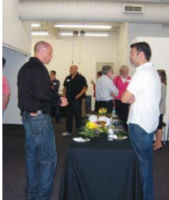
Hallmark Alumni & Friends gathering