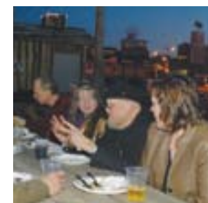
"Pig Roast" at Grinders