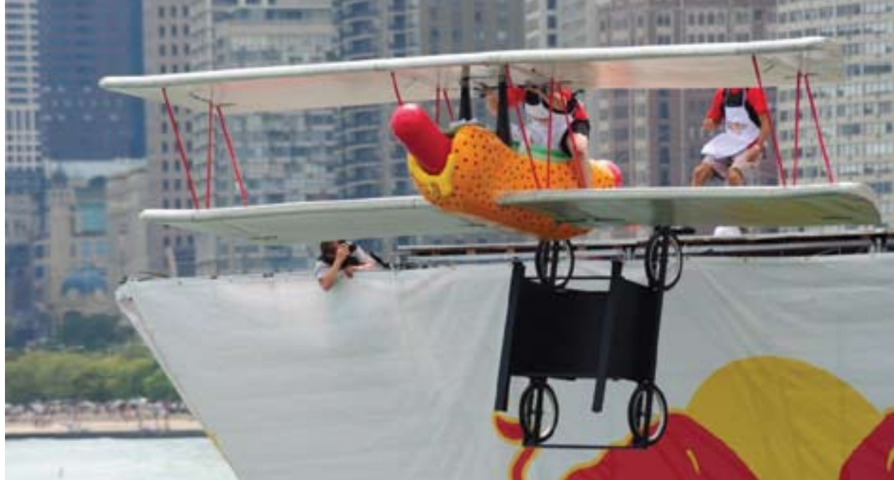
gReGo '96, "Red Hot Flyer II"