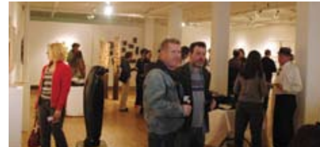
Leedy-Voulikos Art Center, "KCAI Sculpture Faculty Show"